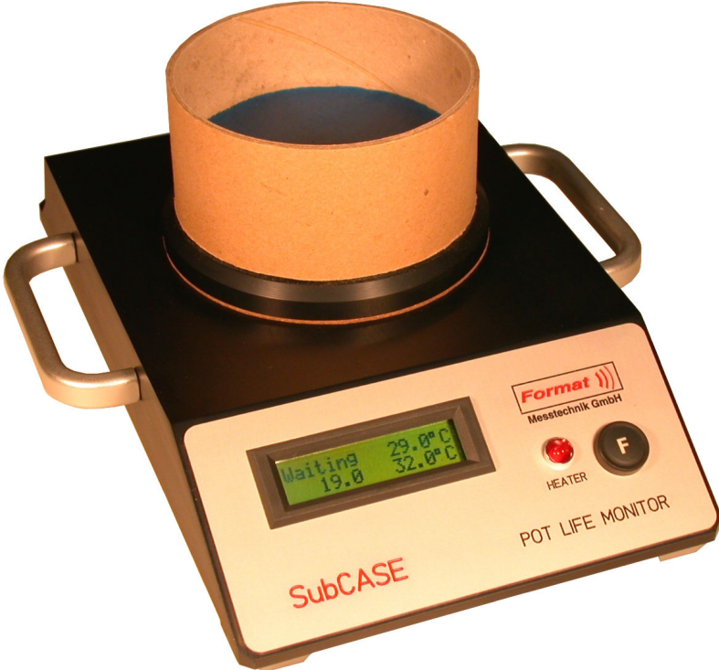
Figure 1. Test device* SubCASE for measuring the pot life and the curing of Coatings, Adhesives, Sealants and Elastomers (CASE).